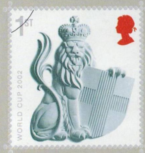
WORLD CUP 2002 KOREA/JAPAN 31 MAY – 30 JUNE