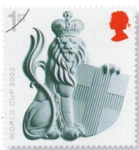
Self-adhesive book A £1.62 book containing two World Cup Lion stamps and four 1st definitives, all self-adhesive, will be available from 21 May.